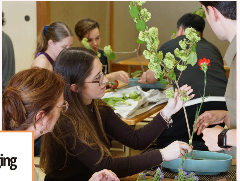
Friday, May 2nd Japanese Flower Arranging (Ikebana) Experience