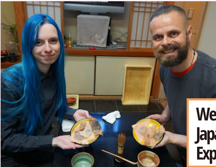
Wednesday, May 7th Japanese Sweet Making Experience