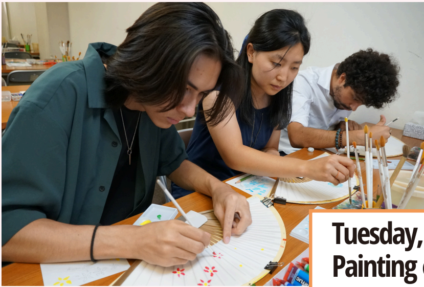
Tuesday, April 15th Painting on SENSU (Traditional Japanese folding fan) experience