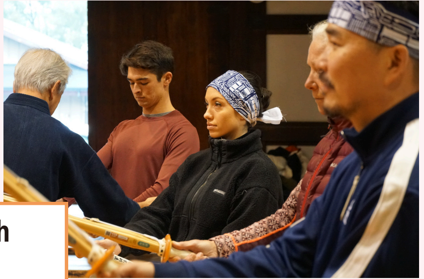
Thursday, April 10th Kendo Experience