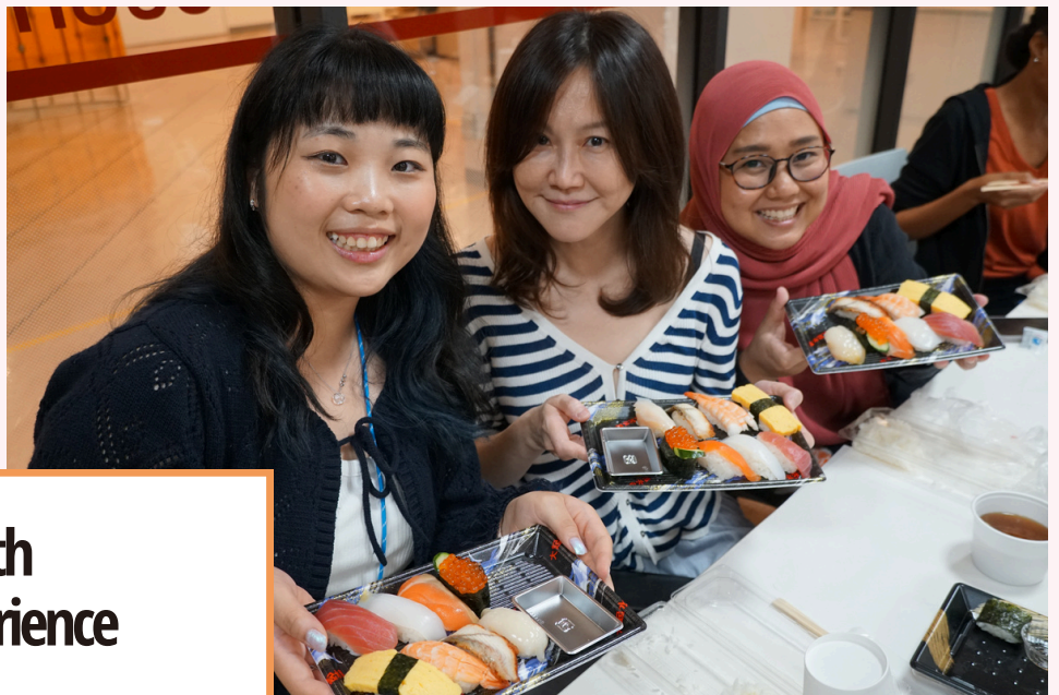
Thursday, April 17th Sushi Making Experience